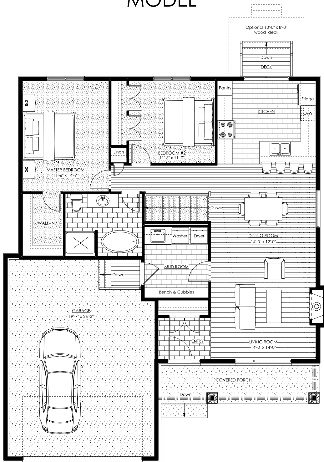
MAIN FLOOR PLAN RENDER 1282 SQ.FT.